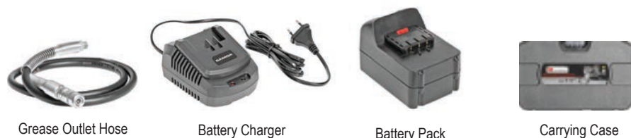
Grease Outlet Hose

With grease coupler for easy access to lube points.